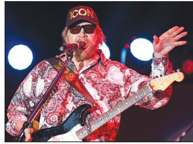
It was standing-room only at the Hank Williams Jr. concert on Saturday, April 6, inside Anderson Music Hall.