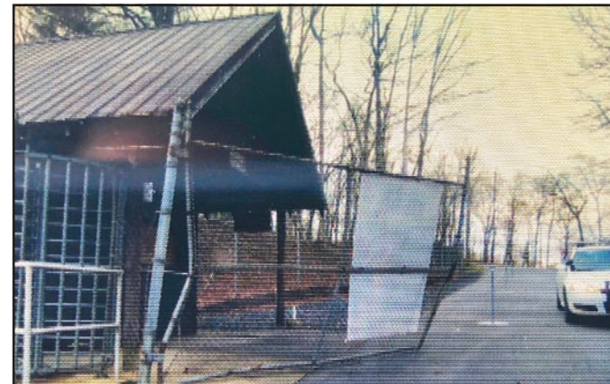
A picture of the damaged front gate at the Georgia Mountain Fairgrounds that somebody drove through over the weekend.

"The suspects also attempted to steal an ATM machine located on the property," according to a TCSO statement. "A Georgia Mountain Fairgrounds pickup truck was